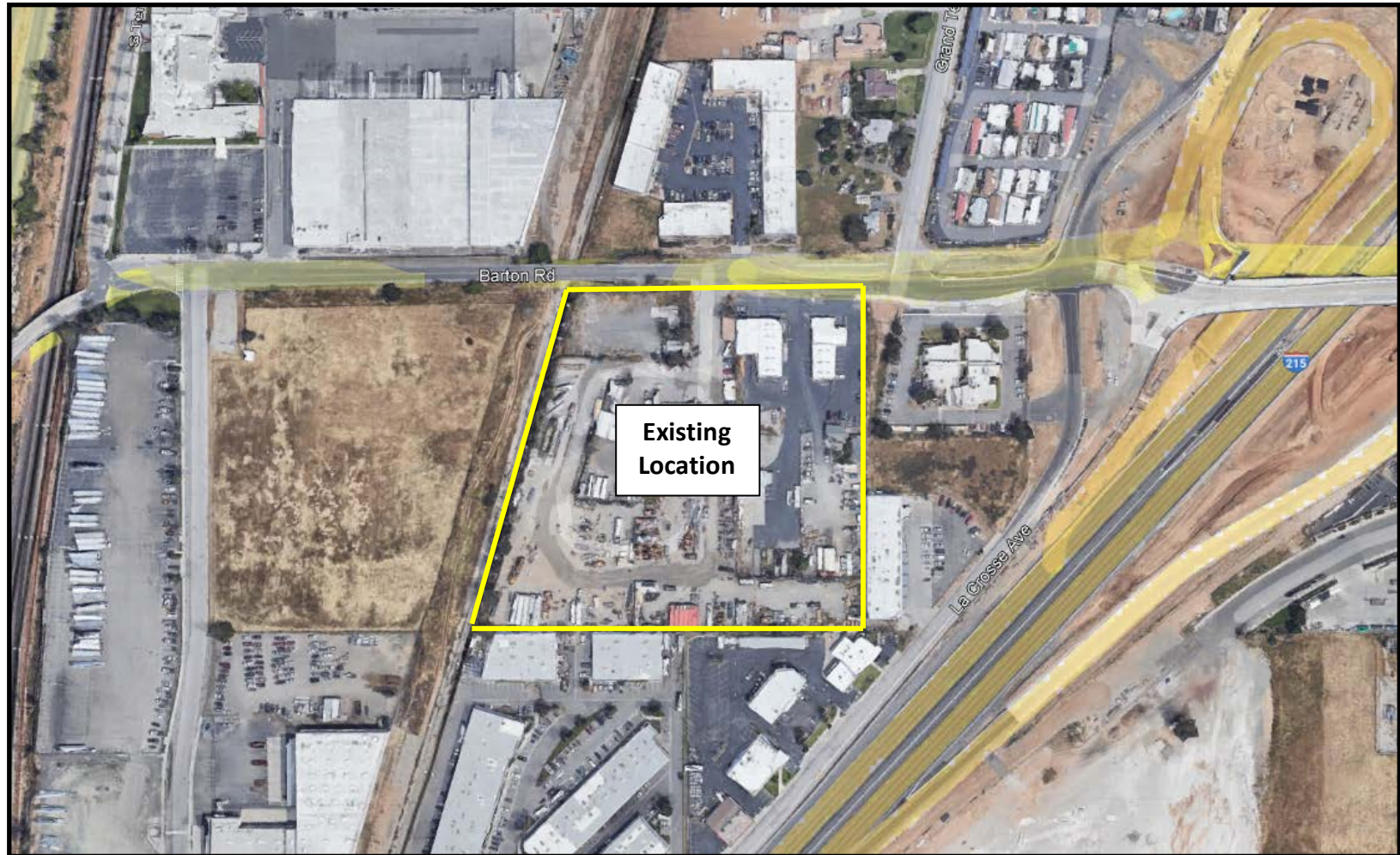
Barton Road Development Project City of Grand Terrace