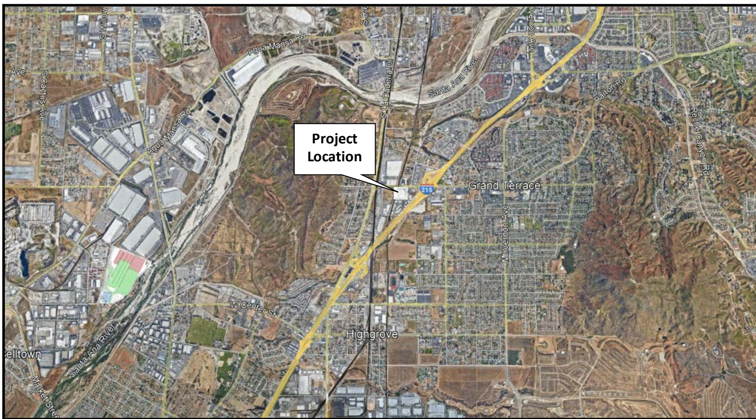
Barton Road Development Project City of Grand Terrace